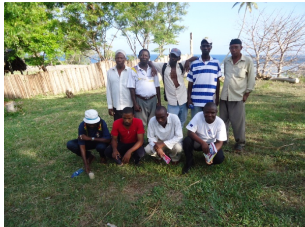
Participants group photo