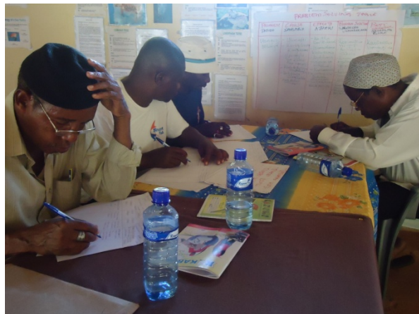
Busy participants in group work