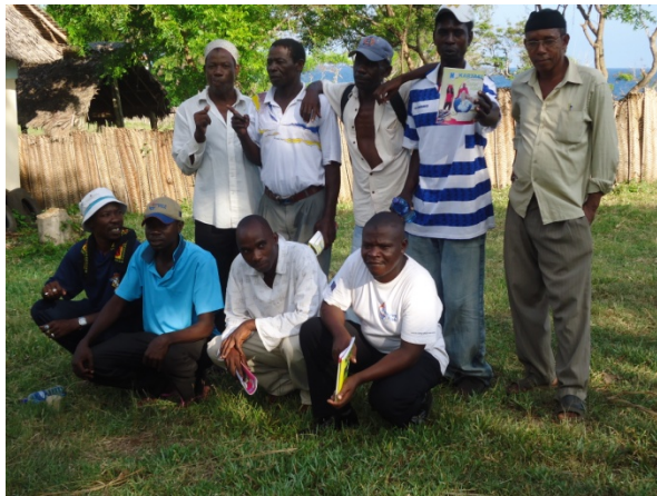
Participants group photo