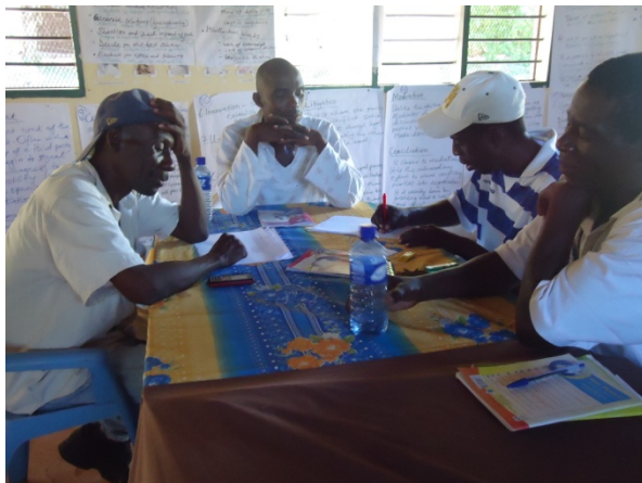
Participants in group work session